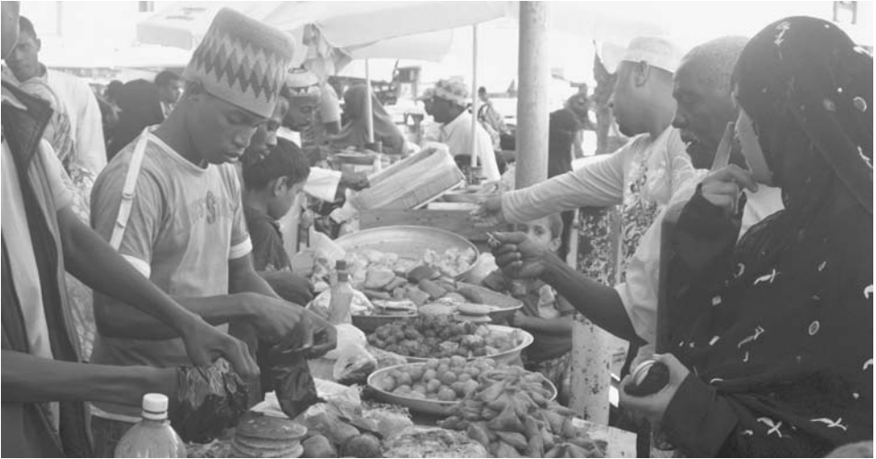
Muslims buy food from street vendors along Abdel Nasser Road in Mombasa, Kenya.

corn are eaten plain, but mainly it is rubbed with lemon slices and served with spicy chili powders called pili pili or piripiri . Corn can also be served boiled. Peanuts and groundnuts are planted deep in African food culture, so it is no surprise that these are roasted and served in small paper cones almost everywhere as snacks and as sources of protein.